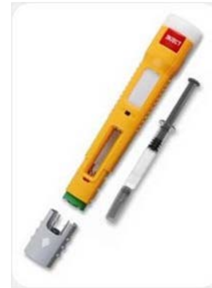
Pre-Filled Syringe or AutoInjectors