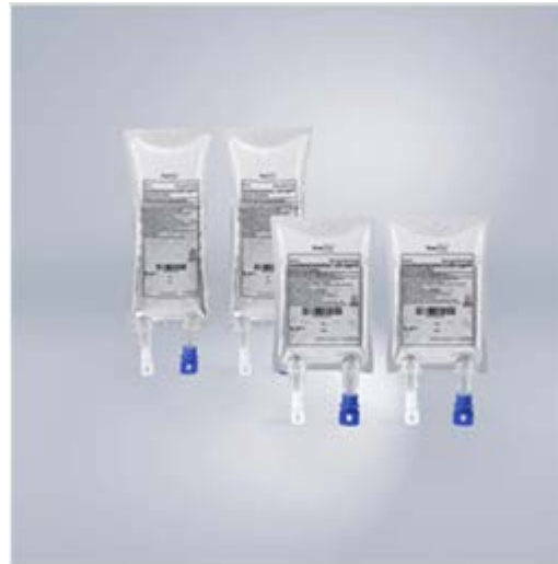
Flexible Plastic PreMix bags